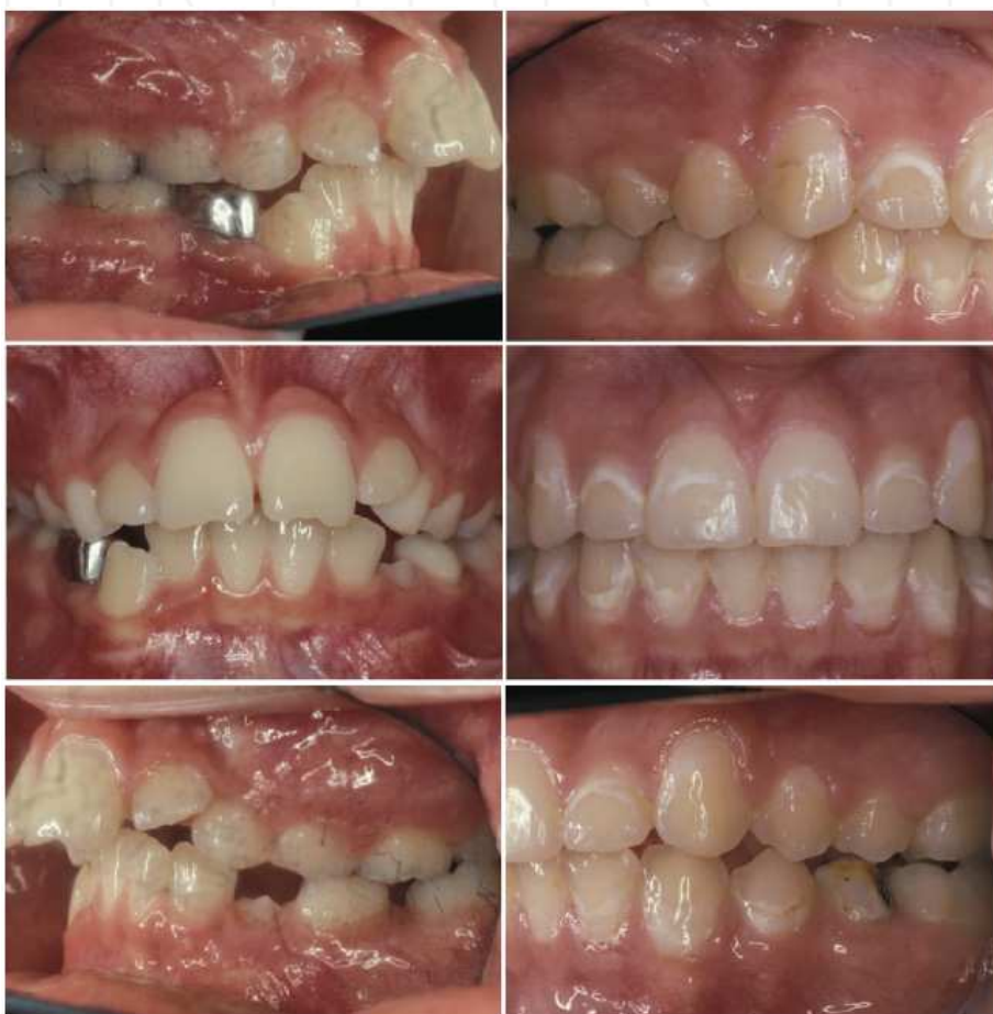
Fig. 2. Tooth labial surfaces were examined and scored from left first molar to right first molar, maxilla and mandible, before and after orthodontic treatment.

Images were evaluated by trained investigators using a scoring system specifically adapted for use with photographed images ( International Caries Detection and Assessment System II ; Ismail, 2005). Visible labial surfaces examined included maxillary and mandibular central and lateral incisors, canines, first and second premolars, and first molars. The evaluators scored each visible labial tooth surface before and after orthodontic treatment. The scores were combined to determine the labial caries incidence for each patient. Teeth were examined and scored from first molar to first molar, maxilla and mandible (Fig. 2).