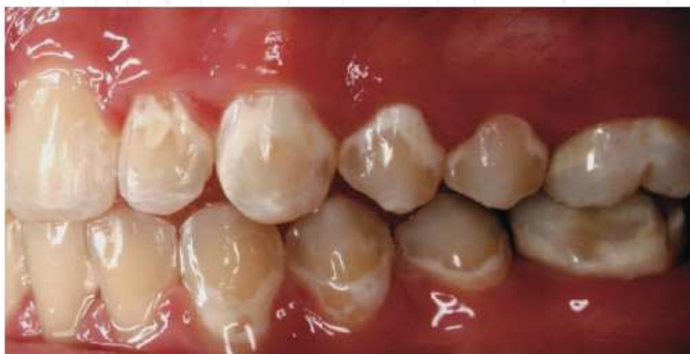
Fig. 1. Incipient caries lesions (white spots) develop around brackets and bands due to poor oral hygiene

One of the most common negative side effects of orthodontic treatment with fixed appliances is the development of incipient caries lesions around brackets and bands, particularly in cases with poor oral hygiene (Fig. 1). Caries lesions typically form around the bracket interface, usually near the gingival margin (Gorelick et al. , 1982). Certain bacterial groups such as mutans streptococci and lactobacilli ferment sugars to create an acidic environment that over time might lead to the development of dental caries. Since orthodontic appliances make plaque removal more difficult, patients are more susceptible to carious lesions. The irregular surfaces of brackets, bands, wires, and other attachments also limit naturally occurring self-cleaning mechanisms, such as movement of the oral musculature and saliva (Rosenbloom and Tinanoff, 1991).