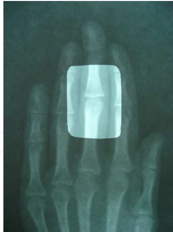
Fig. 2. Placement of the prepared paper on the union between the middle phalanx and the proximal phalanx of the third finger, in the radiographic of the left hand.

The analysis of the radiographic was carried out using a compass to measure the bone size in the middle phalanx and the maturation stage was classified with A to E, according to the classification proposed by Toledo (Toledo, 2004). With this procedure it was possible to locate each patient evaluated in a stage of maturation of the middle phalanx of the third finger, the same one was carried out by the main investigator and a specialist in Orthodontics, member of the investigation team, in two different opportunities to calculate the variability intra and inter observant.