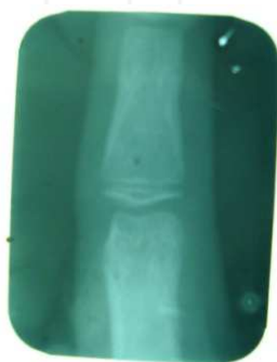
Fig. 3. Radiographic of middle phalanx of the third finger.

An auxiliary table will be used, where the radiography of 41x31 mm. will be placed, with the vertical bigger axis coinciding with the same position of the phalanx and with the active face in front of the focus. The radiograph will be located on the union between the middle and proximal phalanx of the third finger of the left hand, with the coincident located reference point with the proximal phalanx. The focus will be centered in perpendicular sense to the table, with an angle of 90 °, at a distance focus film, using short cone, of 11 cm. with a time of exhibition of 0,5 second. The calibration of the machine will be of 110 volt / 10 MA / seg. They will take all the measures of protection radiological established (Ugarte et al., 2004) and a dental machine of X rays and dental films standard of 41x31mm., Kodak marks. The one revealed will be executed looking for soft revealed low contrasts.