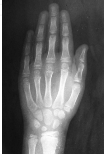
Fig. 1. Radiographic of the left hand.

To each patient was made the clinical history of Orthodontics and was realized an radiographic of the left hand (Fig. 1) where they were determined: the bone age for the method TW2 (Jiménez et al, 1987) and the stages of skeletal maturation for the method of Grave and Brown (Tedaldi et al. 2007).