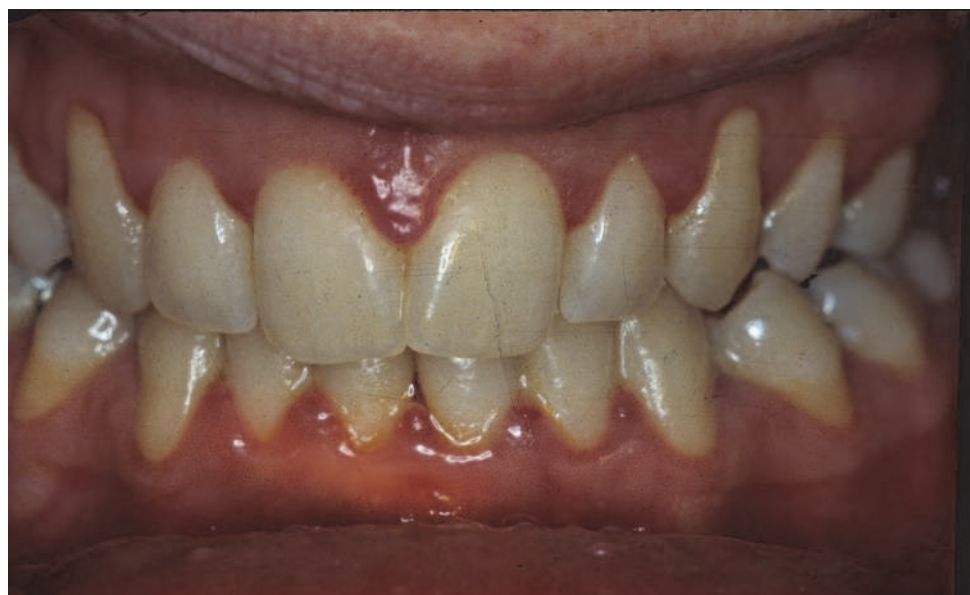
Fig. 1. Gingivitis