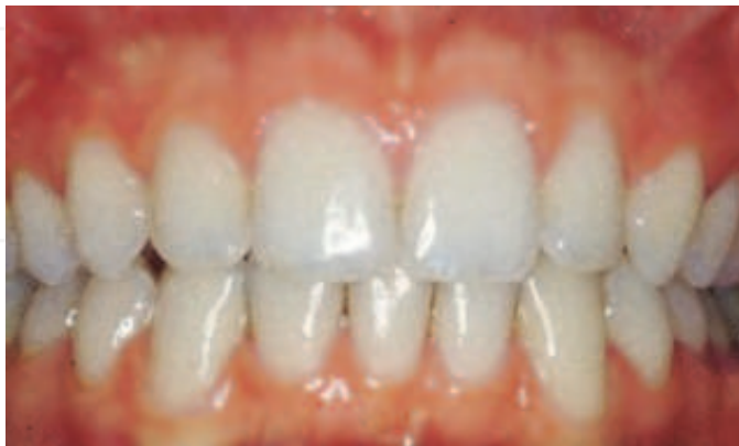
Fig. 5. Healthy Gingivae

Stannous Fluoride – Well known in dentistry for its caries-inhibiting effects, there is evidence that stannous fluoride has properties which altering cell metabolism and cell adhesion (Tinanoff, 1990). Stannous ion enters the cell and affects the growth and adherence of the bacteria. Paraskevas & van der Weijden (2006) in a systematic review of the effects of stannous fluoride on gingivitis, concluded that stannous fluoride toothpaste resulted in a reduction in gingivitis and plaque compared with the control, sodium fluoride toothpaste. This effect however was relatively small. Gunsolly (2006) reports that although stannous fluoride shows a statistically significant antiplaque and anti-gingivitis effect, only the anti-gingivitis effect is clinically significant. He suggests the main action of stannous fluoride is its ability to alter the effect the plaque has on gingivitis, rather than its composition or virulence.