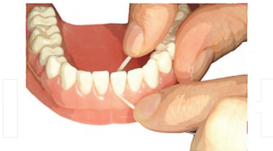
Fig. 2. Flossing