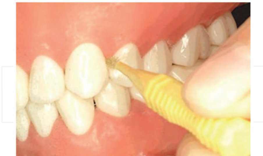
Fig. 4. Interdental Cleaning Brush

Interdental rubber-tipped stimulators are also widely available and have been shown to reduce bleeding scores and gingivitis (Yankell et al, 1992). Another variety of brush designed for specific, difficult to access, areas of the mouth is the 'end-tufted brush'. This can be used effectively in the distal and lingual aspects of molars, posterior to the last molar, in quadrants where third molars are present and in furcation areas.