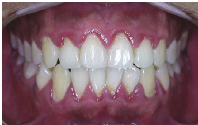
Fig. 2. Severe gingival changes in a woman with heavy plaque deposits during the second trimester (School of Dentistry, Universidad El Bosque, 2010. Used for academic resources)