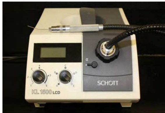
Fig. 10. Fiber-optic transillumination (FOTI).

FOTI (Figure 10) device is a practical, easy, fast and inexpensive method of imaging teeth in the presence of multiple scattering. It is based on the changes in the scattering and absorption phenomenon of light photons that increases the contrast between sound and enamel caries. In other words, results from a local decrease of transillumination owing to the characteristics of the carious lesion. The illumination is delivered via fiber-optics from a light source to a tooth surface. The light propagates from the fiber illuminator across tooth tissue to non-illuminated surfaces. The resulting images of light distribution are then used for diagnosis. Its transmission can be observed either in the opposite side or in the occlusal surfaces, when molars and premolars are analyzed. As light scattering is higher in the demineralized enamel, it is possible to see the lesion as a dark area or a shadow. Besides, carious dentin appears orange, brown or grey underneath the enamel. This can help on the differentiation between enamel and dentin lesions. However, it has been show that FOTI diagnosis by naked eye can be subject to great inter- and intra-examiner variation (Neuhaus et al., 2009).