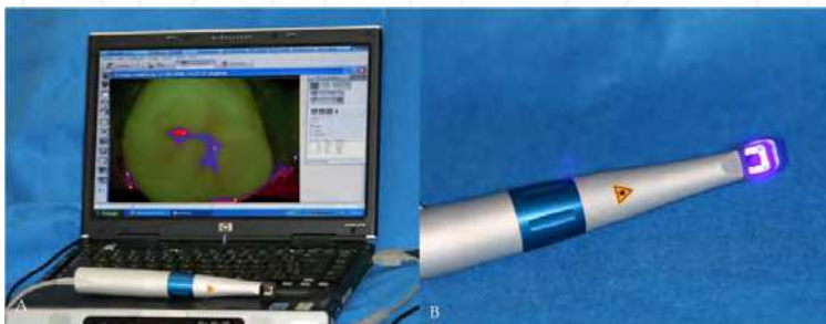
Fig. 8. (A) VistaProof fluorescence camera and DBSWIN software analysis. (B) Six blue LEDs emitting a 405-nm light.

Another device based on the light-induced fluorescence phenomenon is the intraoral camera VistaProof (Dürr Dental, Bietigheim-Bissingen, Germany) (Figure 8) that is based on six blue GaN-LEDs emitting a 405-nm light. With this camera it is possible to digitize the video signal from the dental surface during fluorescence emission using a CCD sensor (charge-coupled device). On these images, it is possible to see different areas of the dental surface that fluoresce in green (sound dental tissue) and in red (cariou dental tissue) (Thoms, 2006). DBSWIN software is used to analyze the images and translate into values the intensity ratio of the red and green fluorescence. According to the manufacturer, those values are related to the lesion extension. The higher is the bacterial colonization, the higher is the red fluorescent signal. The software highlights the lesions and classifies them in a scale from 0 to 5, giving a treatment orientation in the first evaluation: monitoring, remineralization or invasive treatment. However, these values still need to be adjusted (Rodrigues et al., 2008, 2011). Recently, this device showed a good performance in detecting and quantifying dental plaque formed over smooth surfaces under high exposition to sucrose (Raggio et al., 2010).