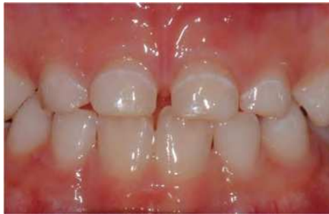
Fig. 2. Inactive carious lesion on the buccal surface. Note the shiny appearance and the position at some distance from the gingival margin.

Clinical-visual diagnosis may be amenable to longitudinal monitoring even though the assessment is qualitative. It would be easier to have a device that would not only detect demineralization but quantify it as well. Then monitoring progression or arrestment would be simple; use the device again and see in what direction the numbers change. The concept is hugely appealing so no wonder researchers have made such efforts to develop, test and perfect such devices. All these methods for caries detection are based on the interpretation of one or more physical signals. These are causally related to one or more features of a caries lesion. First, the signals must be received using a receptor device and classified. The classification of a signal is part of the diagnostic decision-making process. However, none of the methods is capable of processing all these signals to a status that could be called diagnosis. "The art of identifying a disease from its signs and symptoms" is a process that cannot be replaced by a machine or a device.