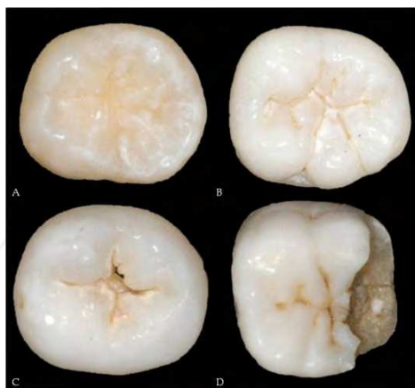
Fig. 1. (A) Sound occlusal surface. (B-D) Caries process in different stages.

Dental caries is a bacteria-associated progressive process of the hard tissues of the coronal and root surfaces of teeth. The net demineralization may begin soon after tooth eruption in caries susceptible children without being recognized by dental professionals. This process may progress further resulting in a caries lesion that is the sign and/or the symptom of the carious process. Caries is in other words a continuum which may be assessed falsely when only a certain time point is considered. Figure 1 shows different stages of the carious process.