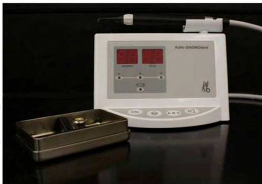
Fig. 5. DIAGNOdent 2095 – a laser fluorescence device for caries detection.

numeric values, which can vary from 0 to 99. Two optical tips are available: tip A for occlusal surfaces, and tip B for smooth surfaces. This device has shown good results in the detection of occlusal caries, however, it might not be used as the only method for treatment decision-making process (Bader & Shugars, 2006; Rodrigues et al., 2008).