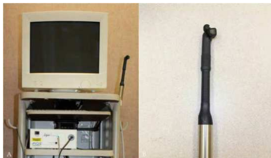
Fig. 11. (A) Digital imaging fiber-optic transillumination (DIFOTI). (B) Tip for occlusal surfaces.