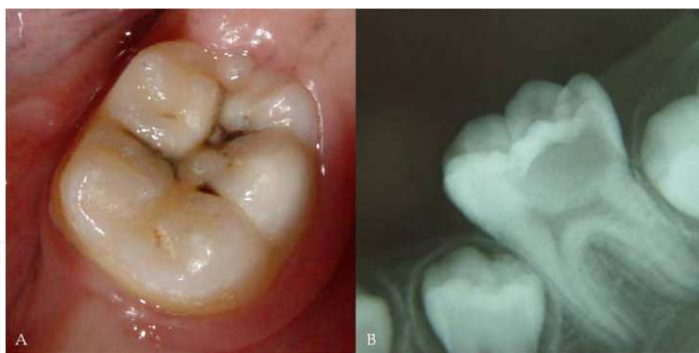
Fig. 4. Detection of occlusal caries. (A) Clinical aspect of a lesion in an intact surface. (B) Radiographic aspect of the lesion penetrating into the dentin - a typical "hidden caries".

Radiographic examination is useful in monitoring caries lesion development, in view of the fact that non-cavitated lesions can be reversed by non-invasive intervention, providing changes in mineral content of dental tissues. However, there are limits to the radiographic examination which should be considered, particularly since lesion behavior has changed, with cavitation occurring much later than previously (Pitts & Rimmer, 1992). Thus, it is worth remembering that radiography is not able to differentiate between an active and an arrested caries lesion, and to distinguish a cavitated and a non-cavitated lesion. According to Ratledge et al. (2001), 50-90% of dentin caries lesions radiographically observed on the approximal surface might present cavitation. There are cases where clinically "sound" and apparently intact occlusal surfaces, however, may develop lesions which penetrate into the dentin, sometimes named "hidden" caries (Ricketts et al., 1997), which can be observed only through radiographic examination (Figure 4).