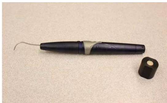
Fig. 9. Midwest Caries I.D. device and the standard for calibration procedure.

Recently, another device for caries detection was developed on LED technology - Midwest Caries I.D. - (DENTSPLY Professional, York, PA, USA) (Figure 9). The handheld device emits a soft light emitting diode (LED) between 635 nm and 880 nm and analyzes the reflectance and refraction of the emitted light from the tooth surface, which is captured by fiber optics and is converted to electrical signals for analysis. The microprocessor of the device contains a computer-based algorithm that identifies the different optical signature (changes in optical translucency and opacity) between healthy and demineralized tooth (Strassler and Sensi, 2008).