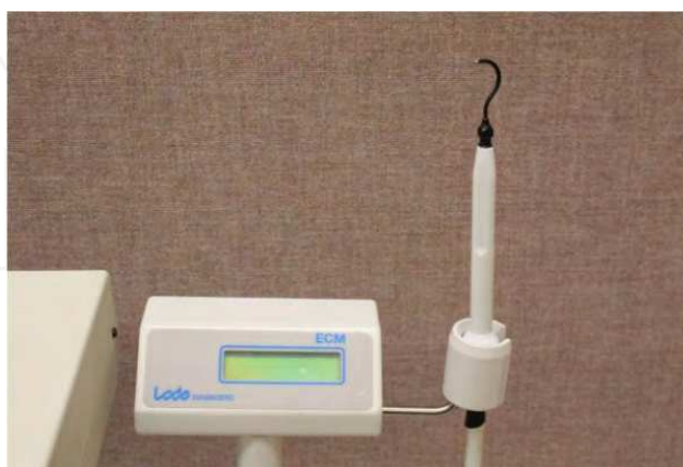
Fig. 12. Electrical caries monitor (ECM).

The studies on electrical caries monitor device (ECM) (Figure 12) have assessed these parameters in a “site-specific” or “surface specific” mode. This method has shown different results of reproducibility and validity (Huysmans et al., 2005; Kühnisch et al., 2006). Some in vitro studies indicated that the presence of stain is a confounder for ECM measurements. Besides, the different cut-off limits for enamel and dentin caries lesions may be needed for stained teeth (Côrtes et al., 2003; Ellwood & Côrtes, 2004). Therefore, its indication in the clinical practice is still uncertain. Further in vivo studies are necessary in order to make this technology useful in the practice.