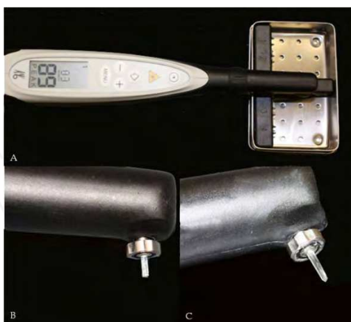
Fig. 6. (A) DIAGNOdent 2190 or DIAGNOdent pen calibration against the standard ceramic. (B) Occlusal tip. (C) Approximal tip.

Recently, a new and compact device - DIAGNOdent 2190 or DIAGNOdent pen - (KaVo, Biberach, Germany) (Figure 6) has been introduced in the market. This device functions on the same principle as the earliest. For this reason, the device was condensed and the tips were modified. The tips used in this device are made from sapphire fiber and the same solid single sapphire fiber tip is used for propagation of the excitation and for collection of the fluorescence light, but in opposite directions and different wavelengths (Lussi & Hellwig, 2006). There are two tips which can be coupled on this device: an occlusal and an approximal tip. However, its performance in approximal surfaces is still limited. The device weighs 140g and only one battery (1,5V) is needed.