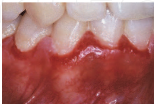
Fig. 5. Mild erythema and swelling of gingiva associated with PV.

In PV bullae rupture rapidly and intact bullae formation in the oral cavity is rarely seen. Oral PV is often regarded as difficult to diagnose in its early stages because less characteristic oral manifestations are produced than those associated with cutaneous PV. Diagnostic delays greater than 6 months are common in oral PV (Sirois et al., 2000). If the treatment is delayed due to misdiagnosis or inadequate initial management, the risk of the disease spreading or other complications may increase. Clinically, PV frequently begins with oral lesions and later progresses to skin lesions. Lesions may occur anywhere on the oral mucosa (Bystryń & Rudolph, 2005; Mignogna et al., 2001). On occasion, the gingiva is the only site involved in early lesions, and DG is a common manifestation of the disease (Endo et al., 2005, 2008c; Mignogna et al., 2001) (Figs. 5 and 6). Acantholytic (Tzanck) cells can be confirmed in cytologic smears obtained by scratching the gingiva (Endo et al., 2008a; Mignogna et al., 2001). Tzanck cells show degenerative changes, including round, swollen hyperchromatic nuclei with a homogenous cytoplasm (Endo et al., 2008a).