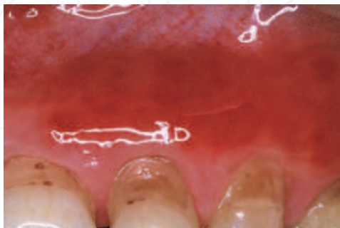
Fig. 7. Gingival erythema following use of a toothpaste

(Figs. 7 and 8). These reactions may appear identical to DG and be difficult to differentiate from mucocutaneous diseases. Non-specific histopathologic findings with submucosal perivascular inflammatory cell infiltration should raise suspicion of a contact hypersensitivity etiology (Endo & Rees, 2006; Endo et al., 2010). Patient maintenance of a 1 to 2 week food diary is often beneficial in identifying the causative agent(s). It is also recommended that the patients record the use and frequency of oral hygiene products. Patients are considered to have allergic reactions to a relevant allergen if their patch test results are positive. Eliminating causative agent(s) leads to disappearance of gingival lesions in most contact hypersensitivity cases.