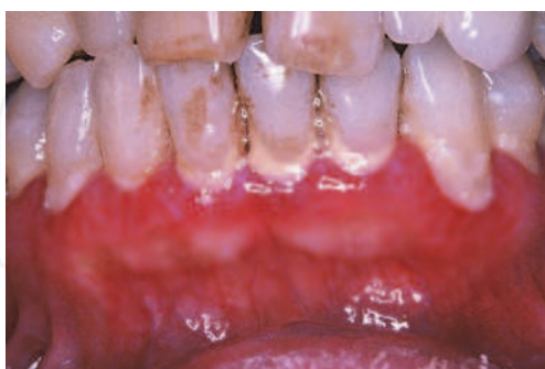
Fig. 13. Initial presentation associated with MMP in a 51-year-old woman. The initial examination revealed mild erythema and swelling of the gingiva with plaque and calculus deposits. The gingiva bled easily, and it was hard for her to brush her teeth.

Treatment of DG requires elimination or control of local irritants. Rough restorations, ill-fitting dentures, traumatic oral hygiene procedures, and dysfunctional oral habits should be corrected (Endo et al., 2006b; Fatahzadeh et al., 2006). Prosthetic treatment for patients having DG should be limited to a fixed prosthesis, since wearing a tissue-borne prosthesis may be uncomfortable (Erpenstein, 1985; Fatahzadeh et al., 2006). In some cases, DG can be successfully managed with topical corticosteroids combined with effective plaque control (Endo et al., 2005; Endo et al., 2008b; Endo et al., 2008c; Guiglia et al., 2007) (Figs. 13 and 14). The symptoms of the gingiva were improved by meticulous oral hygiene habits in some DG patients with oral LP (Erpenstein, 1985; Guiglia et al., 2007; Holmstrup et al., 1990) (Figs. 15 and 16). Plaque accumulation may be a stimulus factor to make DG worse, but the plaque itself does not cause DG. Therefore, it should be noted that the underlying causes of DG cannot be eliminated by plaque control alone.