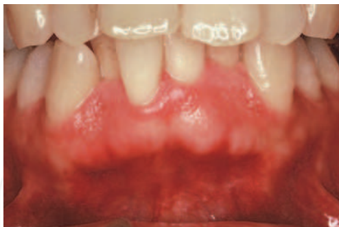
Fig. 12. Treatment response associated with PV in a 46-year-old woman. DG was successfully managed with systemic treatment by a dermatologist.

Treatment of DG requires elimination or control of local irritants. Rough restorations, ill-fitting dentures, traumatic oral hygiene procedures, and dysfunctional oral habits should be corrected (Endo et al., 2006b; Fatahzadeh et al., 2006). Prosthetic treatment for patients having DG should be limited to a fixed prosthesis, since wearing a tissue-borne prosthesis may be uncomfortable (Erpenstein, 1985; Fatahzadeh et al., 2006). In some cases, DG can be successfully managed with topical corticosteroids combined with effective plaque control (Endo et al., 2005; Endo et al., 2008b; Endo et al., 2008c; Guiglia et al., 2007) (Figs. 13 and 14). The symptoms of the gingiva were improved by meticulous oral hygiene habits in some DG patients with oral LP (Erpenstein, 1985; Guiglia et al., 2007; Holmstrup et al., 1990) (Figs. 15 and 16). Plaque accumulation may be a stimulus factor to make DG worse, but the plaque itself does not cause DG. Therefore, it should be noted that the underlying causes of DG cannot be eliminated by plaque control alone.