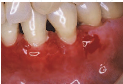
Fig. 3. Desquamative lesions with bleeding on the attached gingiva associated with MMP.

MMP is one of a group of autoimmune, subepithelial blistering diseases that predominantly affect the mucous membranes (Bagan et al., 2005; Chan et al., 2002; Fleming & Korman, 2000; Scully & Lo Muzio, 2008). Most patients with this disease are in the fifth or sixth decade of life, and the majority of them are women (Chan et al., 2002; Fleming & Korman, 2000; Scully & Lo Muzio, 2008). Oral lesions are observed in almost all cases, and the primary lesion often appears in the oral cavity (Chan et al., 2002; Fleming & Korman, 2000; Scully & Lo Muzio, 2008). DG is a common manifestation of MMP (Carrozzo et al., 2004; Endo et al., 2006a) (Figs. 3 and 4). The gingiva appears erythematous with a diffuse or patchy distribution. Vesiculobullous lesions on the gingiva break easily and form erosions with irregular margins. Other oral sites include the buccal mucosa, palate, alveolar ridge, tongue, and lip (Chan et al., 2002; Fleming & Korman, 2000). Extraoral mucous membranes including the conjunctiva, skin, pharynx, external genitalia, nose, larynx, anus and esophagus may also be affected (Chan et al., 2002; Fleming & Korman, 2000).