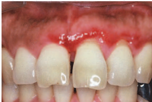
Fig. 15. Initial presentation associated with LP in a 55-year-old woman. The initial examination revealed moderate erythematous attached gingiva.