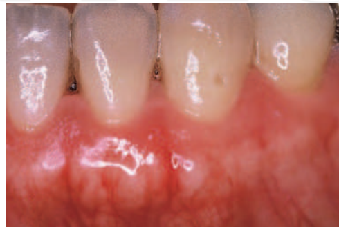
Fig. 10. Treatment response associated with PV in a 31-year-old woman. The gingival lesions went into remission with the topical corticosteroid therapy. However, the circulating autoantibody titer to desmoglein 3 was consistently high, so the patient should be closely followed.