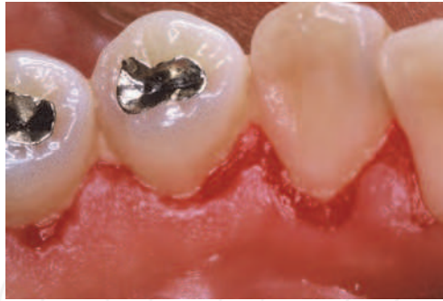
Fig. 6. Eroded gingival surface with ragged edges associated with PV.