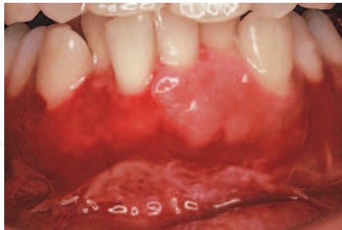
Fig. 11. Initial presentation associated with PV in a 46-year-old woman. The initial examination revealed severe desquamation and erosion on the gingiva. Lesions were also found on the tongue, soft palate, floor of mouth and skin. The patient complained of pain on swallowing.