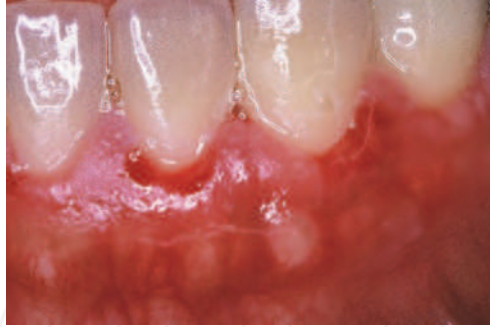
Fig. 9. Initial presentation associated with PV in a 31-year-old woman. The initial examination revealed localized erosions in the marginal gingiva, which is the only site involved in this patient.