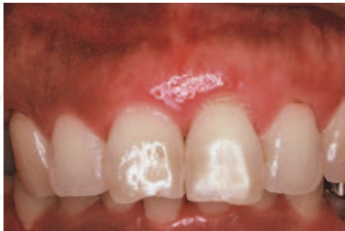
Fig. 16. Treatment response associated with LP in a 55-year-old woman. The condition of the gingiva improved with effective plaque control alone. The improved gingival condition was maintained for a long period.

Periodontal and dental problems are often observed in DG patients. However, little information is available regarding the periodontal and dental management of DG patients