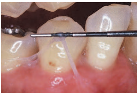
Fig. 8. Epithelial sloughing following use of a mouthrinse