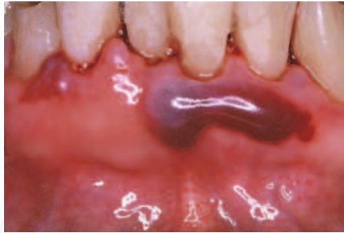
Fig. 4. Localized blood-filled bulla found on the gingiva associated with MMP.