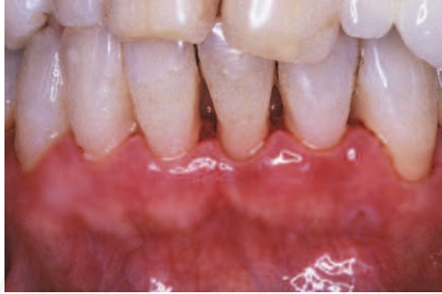
Fig. 14. Treatment response associated with MMP in a 51-year-old woman. The symptoms of the gingiva improved due to a topical corticosteroid combined with effective plaque control.