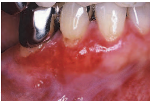
Fig. 2. Patchy erythematous attached gingiva associated with LP.

transient in nature, whereas lesions of oral LP may demonstrate a chronic and protracted clinical course (Al-Hashimi et al., 2007; Endo et al., 2008b; Ingafou et al., 2006; Plemons et al., 1999). Although it is still subject to some controversy, LP may have premalignant potential (Eisen, 2002; Ingafou et al., 2006; Mignogna et al., 2005; Xue et al., 2005). Therefore, it is important to provide treatment and long-term follow-up examinations for patients with LP.